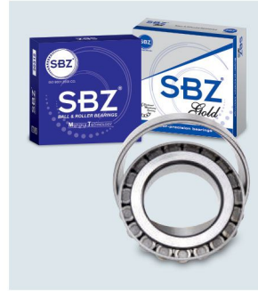
Taper Roller Bearings