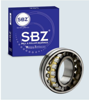
Spherical Roller Metal Cage Bearings