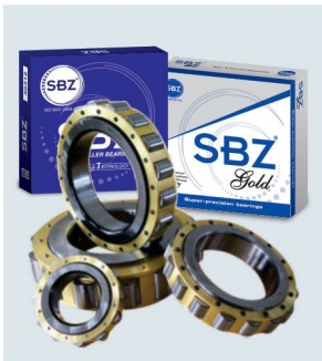
Cylindrical Roller Bearings