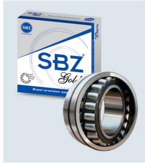
Spherical Roller Steel Cage Bearings