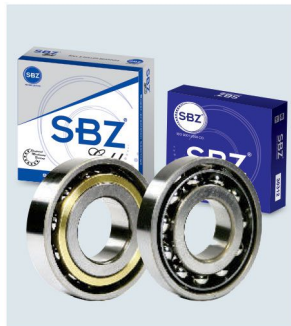
Angular Contact Ball Bearings