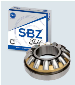
Spherical Thrust Roller Bearings