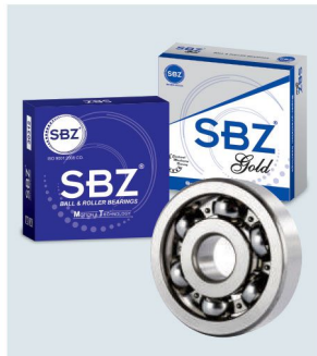
Deep Groove Ball Bearings