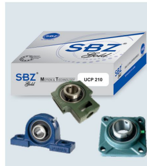
UCP / UCF / UCT Bearings